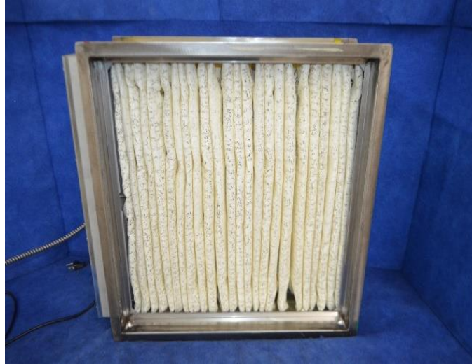
Filter with UV lights