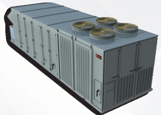
IntelliPak® Rooftop Unit with Symbio™ 800 Controller

Genesis Air Solutions drastically improves indoor air quality with Photocatalytic Oxidation that break down airborne contaminants!