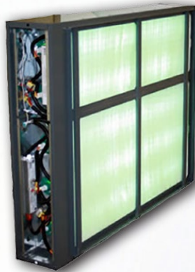
Non-ozone Producing Photo-Catalyst Media is the "Heart" of the System.